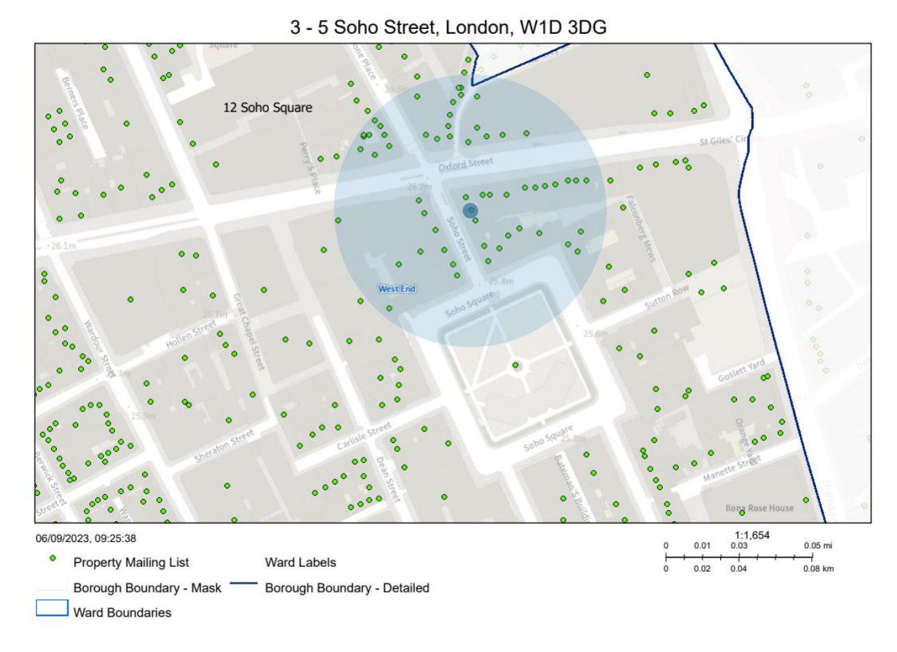
Resident Count: 19